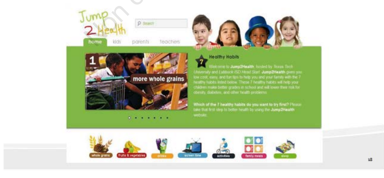
Figure 2. Sample Webpage from the Jump2Health Website<sup>TM</sup> Developed from Phase I Focus Group Discussions with Head Start Parents and Teachers.